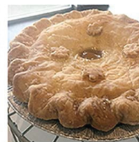
9" FRUIT (double crust)