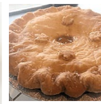
9" FRUIT PIE