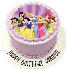
Round Edible Image

edible image will cover 75% of cake, top and bottom border, inscription on cake board