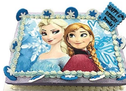
Slab Edible Image

edible image will cover 75% of cake, top and bottom border, inscription on cake board