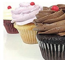
GLUTEN FREE OPTIONS