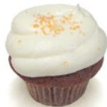
14 KARROT GOLD

decadent chocolate buttercream with vanilla cake