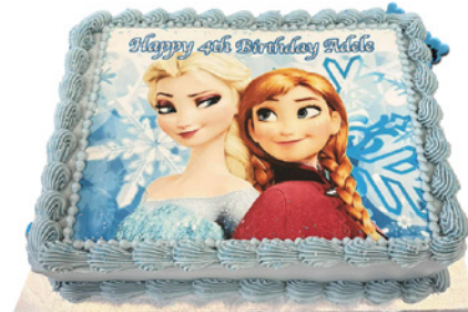
1/4 Slab Edible Image

edible image will cover 75% of cake, top and bottom border, inscription on cake board