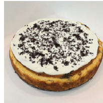
9" Oreo Cheesecake