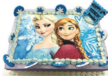
Slab Edible Image

edible image will cover 75% of cake, top and bottom border, inscription on cake board