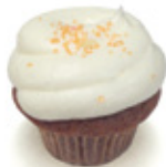
14 KARROT GOLD

decadent chocolate buttercream with vanilla cake