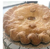
9" FRUIT (double crust)