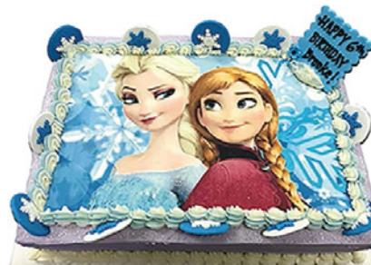
Slab Edible Image

edible image will cover 75% of cake, top and bottom border, inscription on cake board