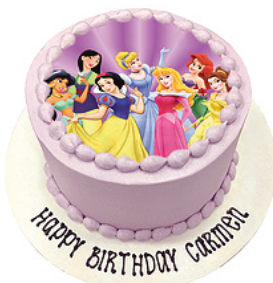
Round Edible Image

edible image will cover 75% of cake, top and bottom border, inscription on cake board