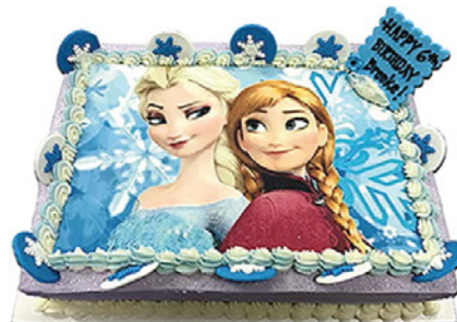
Slab Edible Image

edible image will cover 75% of cake, top and bottom border, inscription on cake board