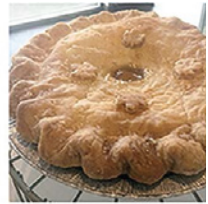
9" FRUIT (double crust)