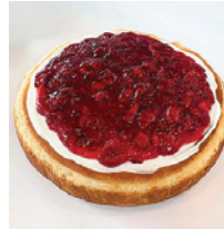
9" New York Cheesecake with cherry topping