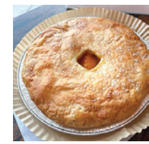
9" Mango-Peach Fruit Pie (Double Crust)