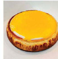
9" New York Cheesecake with lemon topping