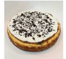
9" Oreo Cheesecake