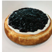
9" New York Cheesecake with blueberry topping