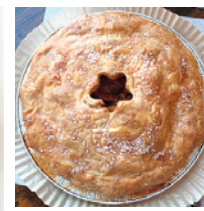
9" Appleh Fruit Pie (Double Crust)