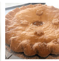
9" FRUIT PIE