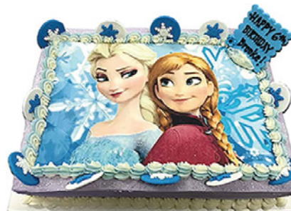
Slab Edible Image

edible image will cover 75% of cake, top and bottom border, inscription on cake board