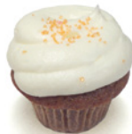
14 KARROT GOLD

decadent chocolate buttercream with vanilla cake