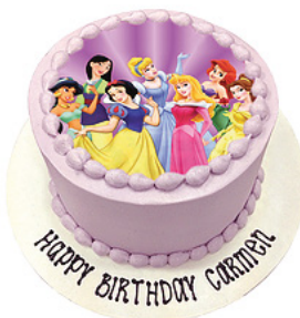
Round Edible Image

edible image will cover 75% of cake, top and bottom border, inscription on cake board