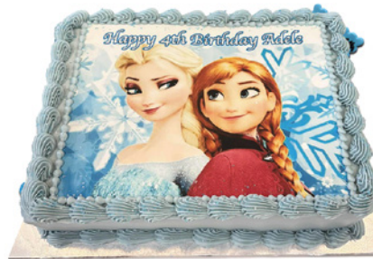
1/4 Slab Edible Image

edible image will cover 75% of cake, top and bottom border, inscription on cake board